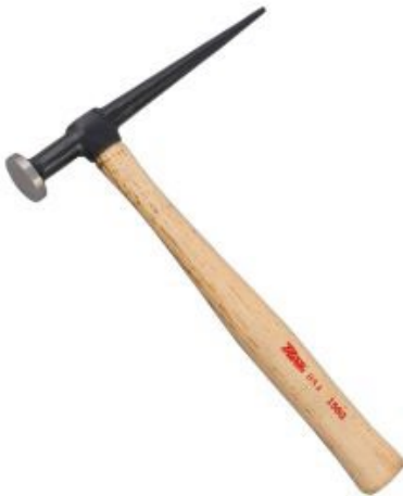
6" Pick Hammer